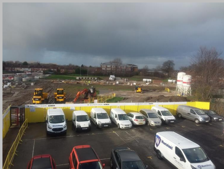
View across site following ground and utility works

Welcome to the Christmas newsletter for Scholars Fields housing development. Following on from our last edition, we are pleased to inform that great progress has been made over the summer months, putting us in a great position for the New Year.