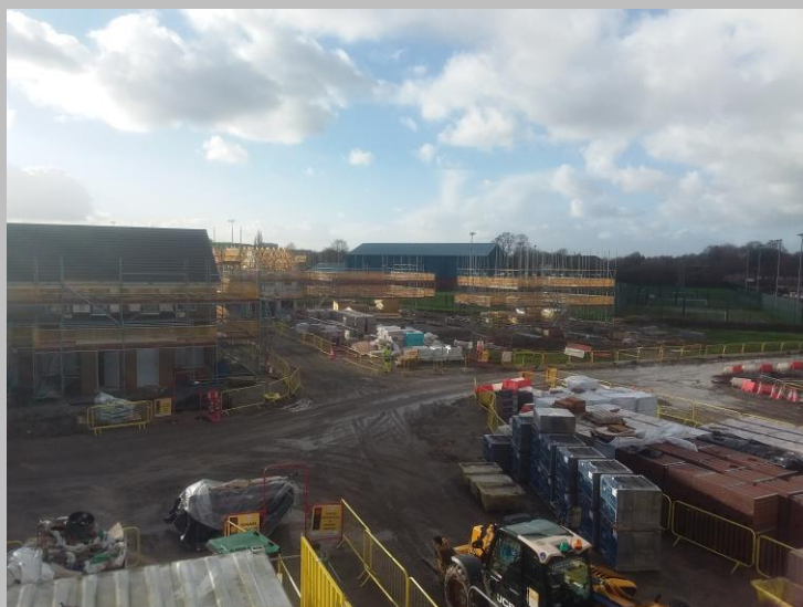
2 show homes shown on left of photo